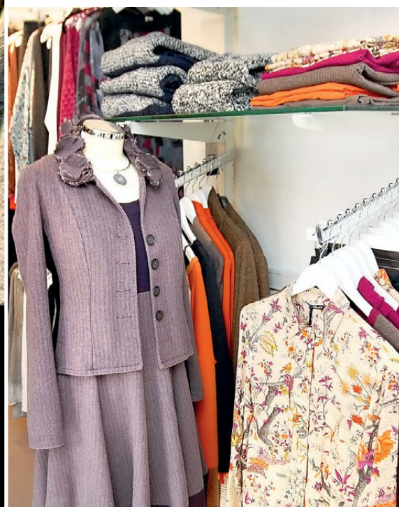
Above: Womenswear in Slate Clothing, including Out of Xile mauve suit