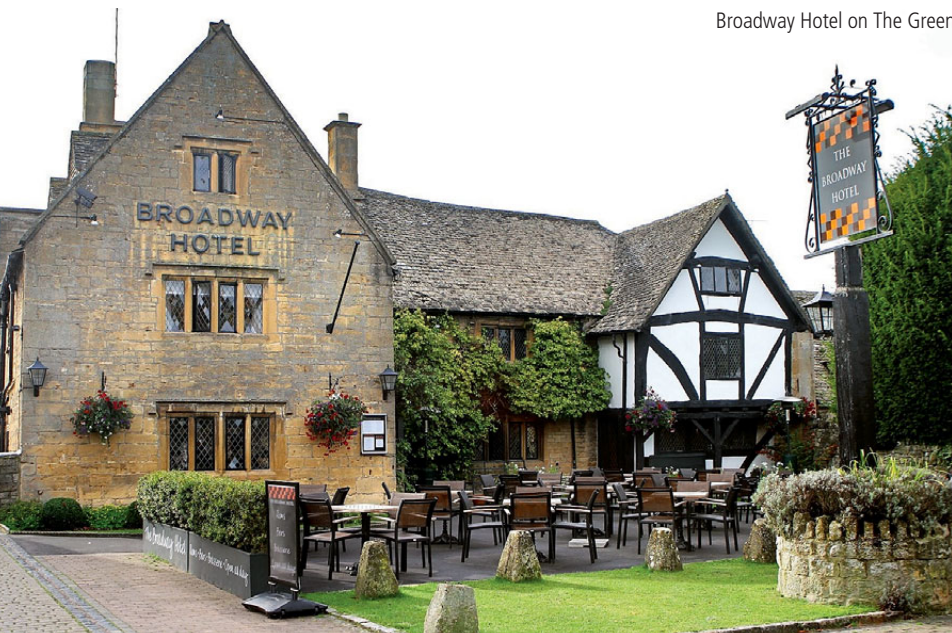
Broadway Hotel on The Green